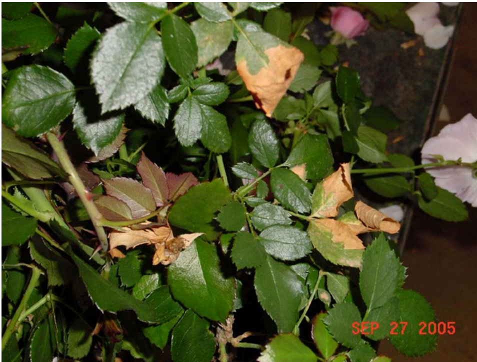
Figure 3. Phytotoxicity symptoms seen on Rosa X 'Meidomonac' PP5,105 12 weeks after treatment with 0 (Control), 2 (1X), 4 (2X), or 8 (4X) oz./gallon Mogeton, applied at weeks 0 and 4. Symptoms included necrotic patches on scattered leaves.