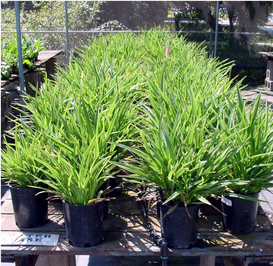
Figure 1. Phormium colinsoi plants were arranged in a randomized complete block design with 3 blocks and 3 treatment replicates per block for the experiment to evaluate the phytotoxicity of Snapshot 2.5TG.