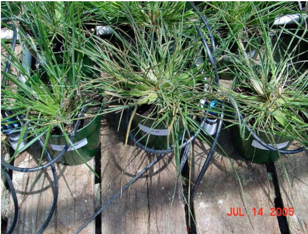
Figure 3. Plants of Pennisetum alopecuroides 'Hameln' one week after the first foliar application of 0 (Control), 2 (1X), 4 (2X), or 8 (4X) oz./gallon Mogeton.