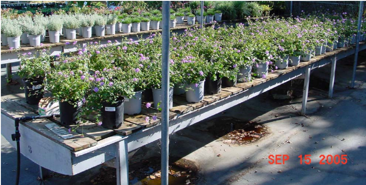
Figure 1. Lantana montevidensis plants were arranged in a randomized complete block design with 3 blocks and 3 treatment replicates per block for the experiment to evaluate the phytotoxicity of Pendulum 2G.