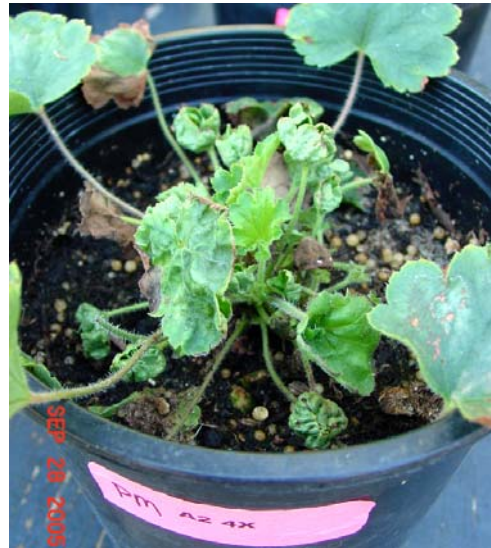
Figure 1. Phytotoxicity symptoms seen on Heuchera sanguinea 'Firefly' plants 8 weeks after treatment with 2.5 lb/A (top), 5 lb/A (bottom left) and 10 lb/A (bottom right) Pennant Magnum 7.62 EC. Foliar spray applications were made at week 0 and week 4. Symptoms included marginal necrosis, puckering and distortion of leaves.