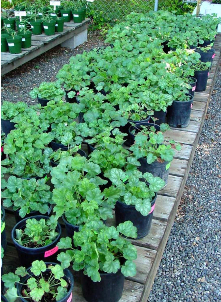
Figure 1. Heuchera sanguinea 'Firefly' plants were arranged in a randomized complete block design with 3 blocks and 3 treatment replicates per block for the experiment to evaluate the phytotoxicity of Pendulum 2G.