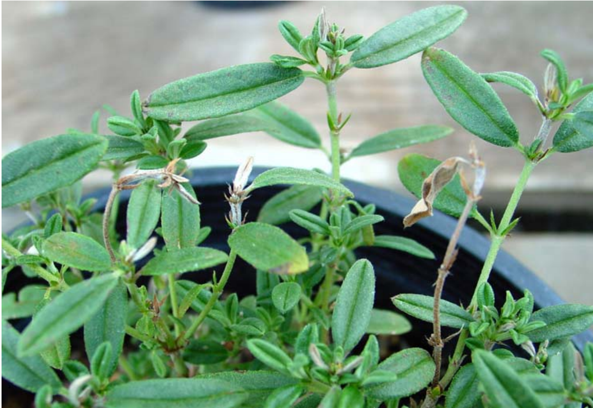
Figure 1. Phytotoxicity symptoms seen on Helianthemum nummularium 'Belgravia Rose' plants 8 weeks after treatment with 10 lb. ai/A (4X rate) of Pennant Magnum 7.62 EC. Foliar spray applications were made at week 0 and week 4. Symptoms included dieback of the terminal portions of branches and necrotic leaves.