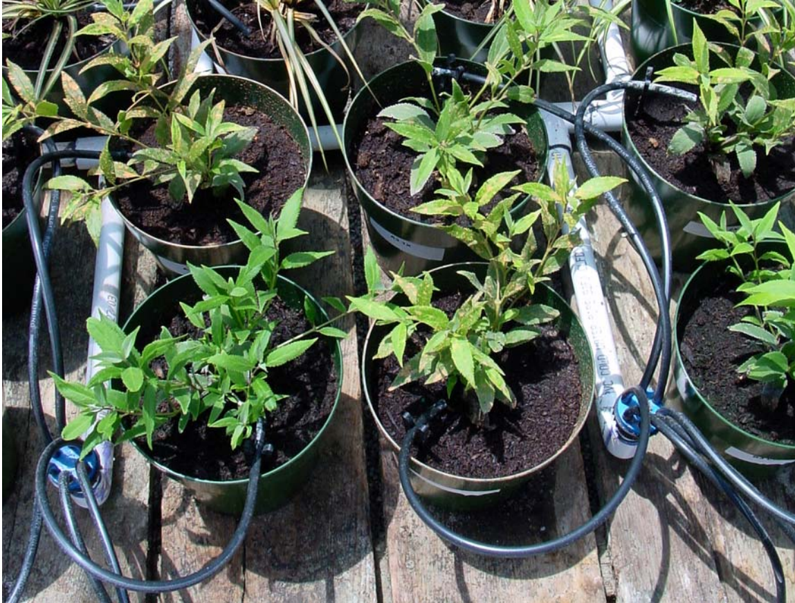
Figure 3. Mogeton spray residue seen on Deutzia gracilis 'Nikko' one week after the first foliar application. The plant at the lower left is a control plant, the others show patches of orange residue on the leaves.