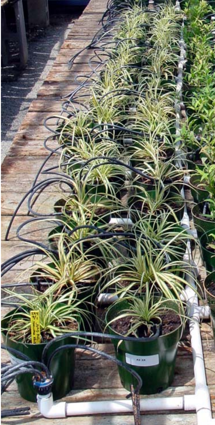
Figure 2. Carex morrowii 'Old Gold' plants were arranged in a randomized complete block design with 3 blocks and 3 treatment replicates per block.