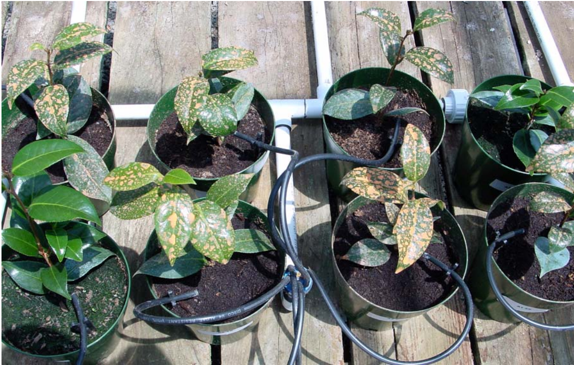
Figure 3. Residue from foliar application of Mogeton seen on Camellia oleifera 'Fire 'n Ice'. Because the plants were irrigated with a drip system, the residue was not washed off.