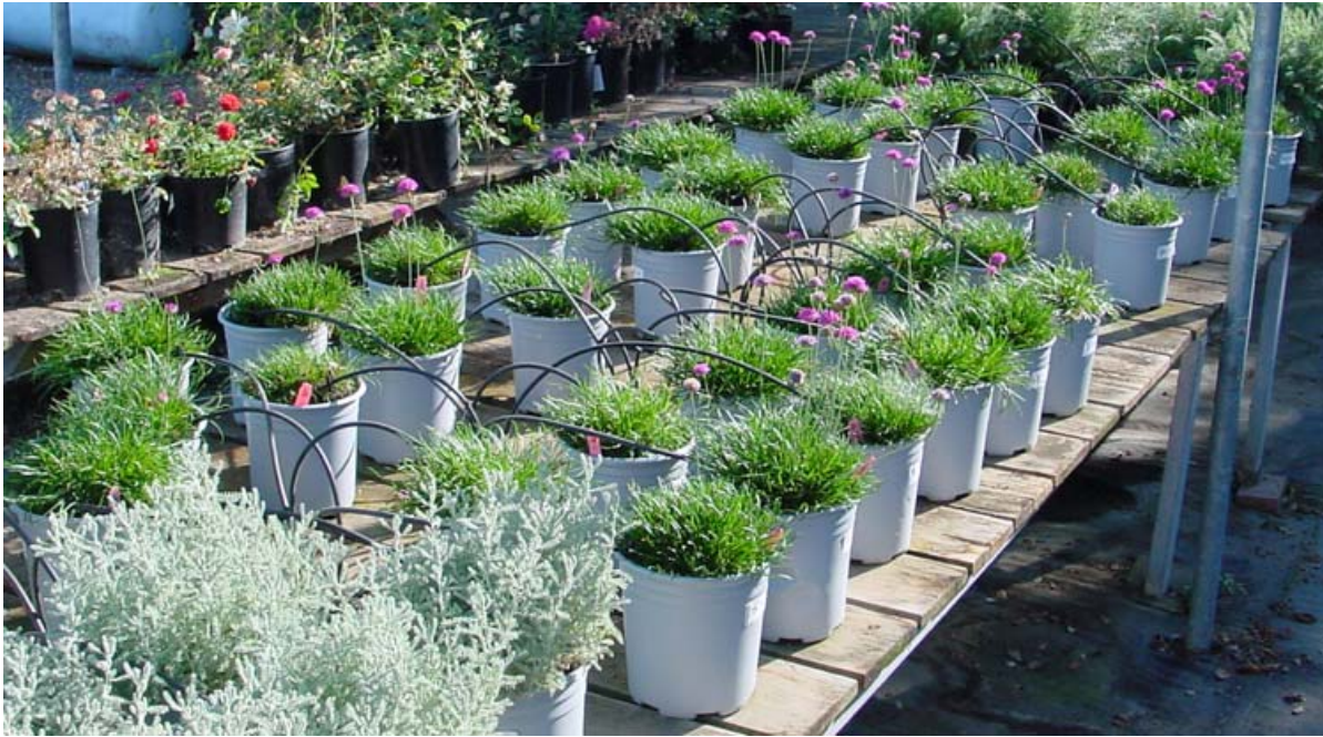
Figure 1. Armeria maritima 'Dusseldorf' plants were arranged in a completely randomized design with 4 replicates per treatment for the experiment to evaluate the phytotoxicity of Pendulum 2G.