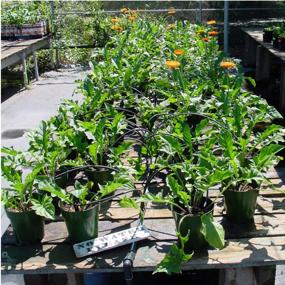
Figure 1. Gerbera jamesonii 'Lambada' plants were arranged in a randomized complete block design with 3 blocks and 3 treatment replicates per block for the experiment to evaluate the phytotoxicity of Snapshot 2.5TG.