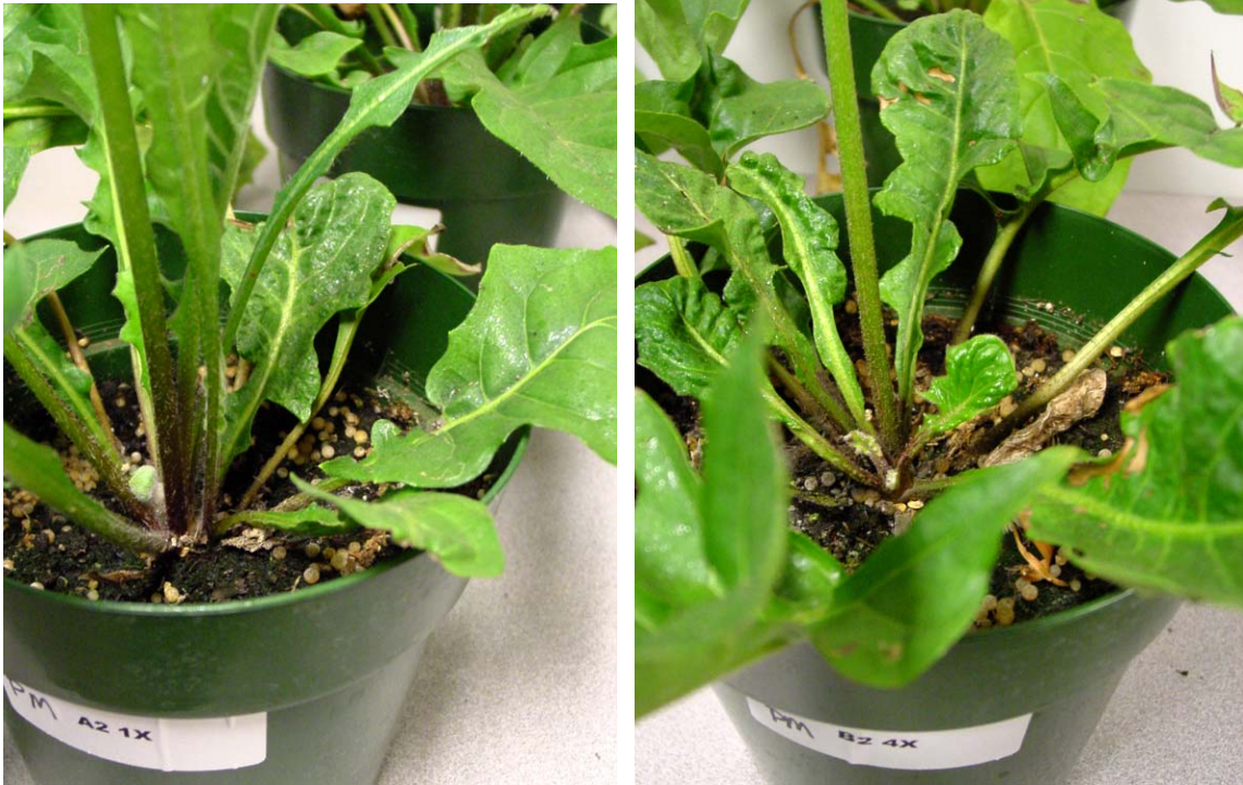
Figure 1. Phytotoxicity symptoms seen on Gerbera jamesonii 'Lambada' plants 8 weeks after treatment with 2.5 lb. ai/A (1X rate) at left and 10 lb. ai/A (4X rate) at right of Pennant Magnum 7.62 EC. Foliar spray applications were made at week 0 and week 4. Symptoms included necrotic patches on leaves and distortion or puckering of new growth.