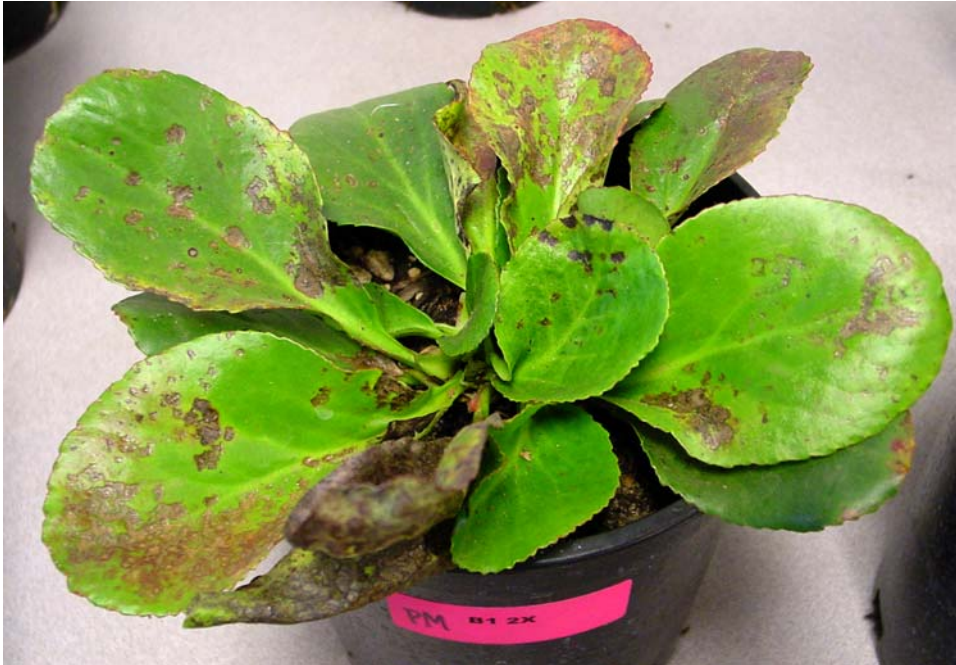
Figure 1. Phytotoxicity symptoms seen on Bergenia cordifolia 'Rotblum' plants 8 weeks after treatment with 5 lb. ai/A (2X rate) of Pennant Magnum 7.62 EC. Foliar spray applications were made at week 0 and week 4. Symptoms included necrotic patches on leaves.