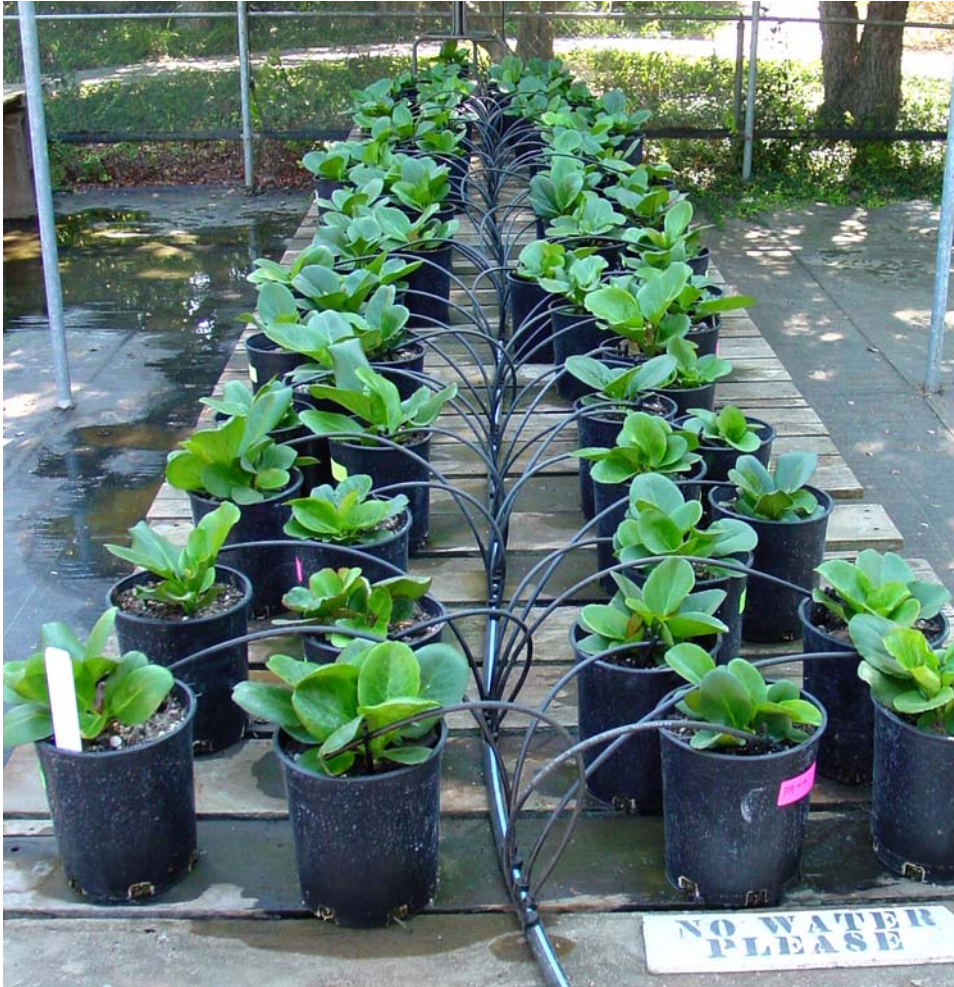
Figure 1. Bergenia cordifolia 'Rotblum' plants were arranged in a randomized complete block design with 3 blocks and 3 treatment replicates per block for the experiment to evaluate the phytotoxicity of Pendulum 2G.