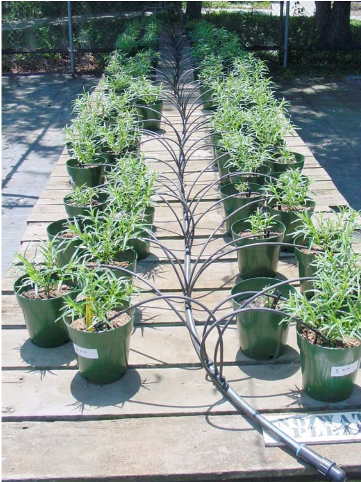
Figure 1. Penstemon X mexicali 'Red Rocks' plants were arranged in a randomized complete block design with 3 blocks and 3 treatment replicates per block for the experiment to evaluate the phytotoxicity of Snapshot 2.5TG.