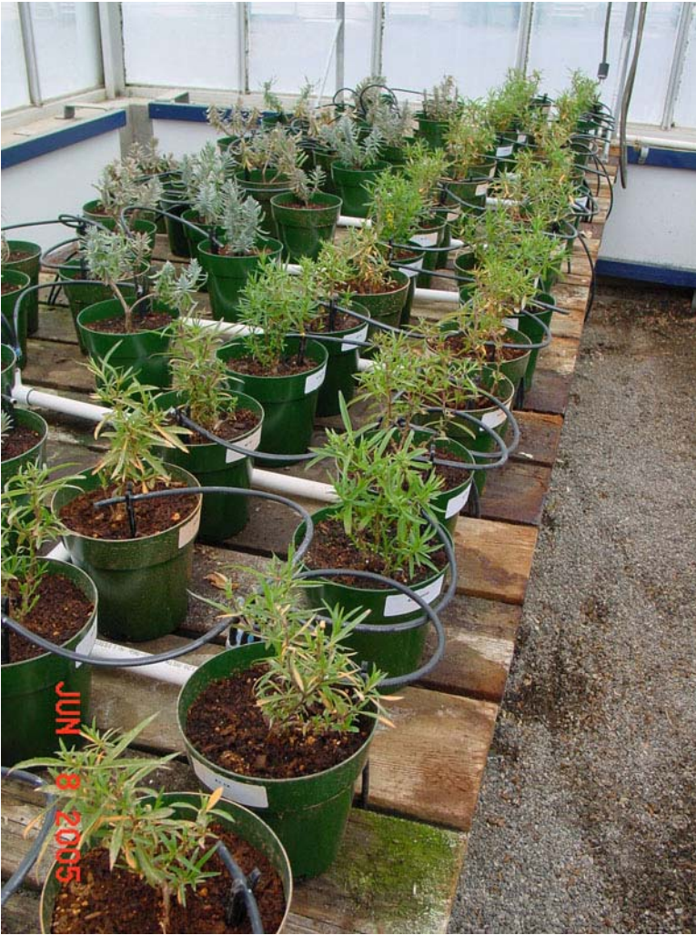
Figure 3. Because the Penstemon X mexicali 'Red Rocks' plants were watered with a drip irrigation system, the orange Mogeton spray residue persisted.