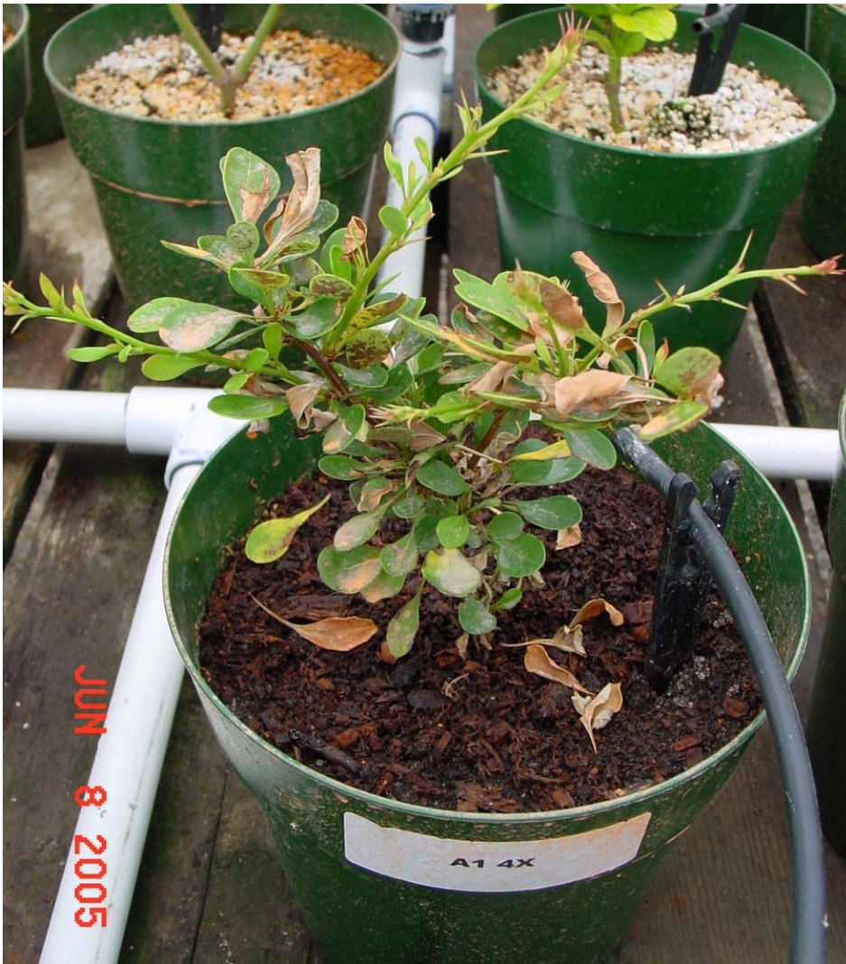
Figure 3. Phytotoxicity symptoms seen on Berberis thunbergii 'Kobold' one week after the first foliar application of 8 oz./gallon (4X) of Mogeton. Symptoms included necrosis and abscission of leaves that came in direct contact with the product.