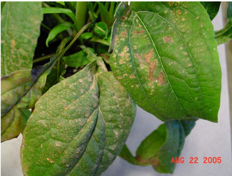
Figure 3. Phytotoxicity symptoms seen on Echinacea purpurea 'Magnus' 12 weeks after 2 foliar applications of Mogeton. Symptoms included leaf distortion (top) and necrotic spots on leaves (bottom).