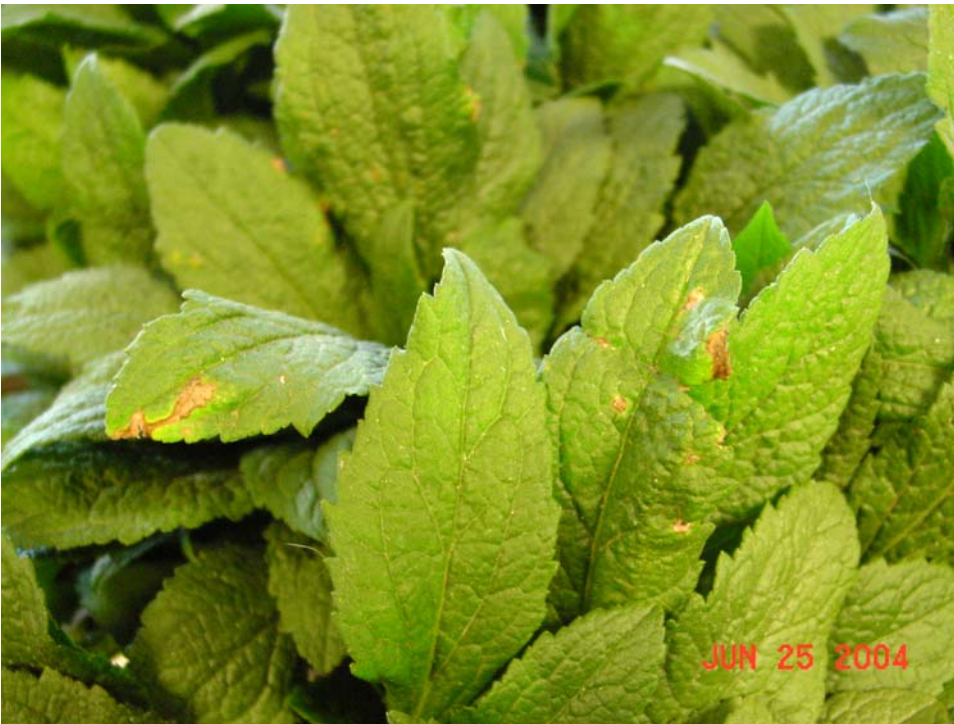
Figure 2. Damage symptoms seen on Solidago rugosa 'Fireworks' plants treated with 0, 2.1, 4.2 or 8.4 lb./A Pennant Magnum 7.62 EC. Necrotic spots occurred on scattered leaves.