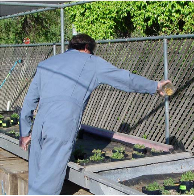
Figure 1. Pendulum 2G was broadcast over the top of the plants using a modified shaker made from a quart-sized Mason jar with perforated lid.