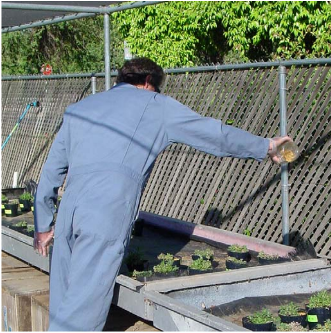
Figure 1. Snapshot 2.5G was broadcast over the top of the plants using a modified shaker made from a quart-sized Mason jar with perforated lid.