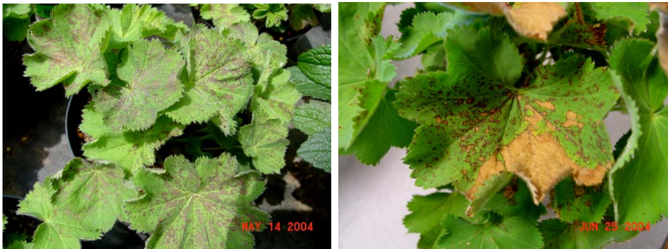
Figure 3. Damage symptoms seen on Alchemilla mollis 'Auslese' plants treated with 0, 2.1, 4.2 or 8.4 lb./A Pennant Magnum 7.62 EC. The plant at left showed contact spray damage three hours after the first application of Pennant Magnum. The plant at right showed advanced necrosis of leaf tissue 6 weeks after the first application.